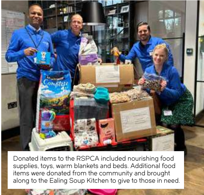
Donated items to the RSPCA included nourishing food supplies, toys, warm blankets and beds. Additional food items were donated from the community and brought along to the Ealing Soup Kitchen to give to those in need.

Our generous Greenford Quay residents and team have been busy coming together to donate essential supplies for the Prevention of Cruelty to Animals (RSPCA - dedicated to animal welfare) and volunteering at the Ealing Soup Kitchen in December. A huge thank you to everyone involved.