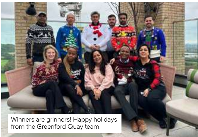
Winners are grinner! Happy holidays from the Greenford Quay team.

With various amenities and improved connectivity, we are proud to be adding significant social value to Greenford, from events and networking gatherings to supporting local businesses and so much more. We can't wait to share with you what's in store for 2024. Stay tuned!