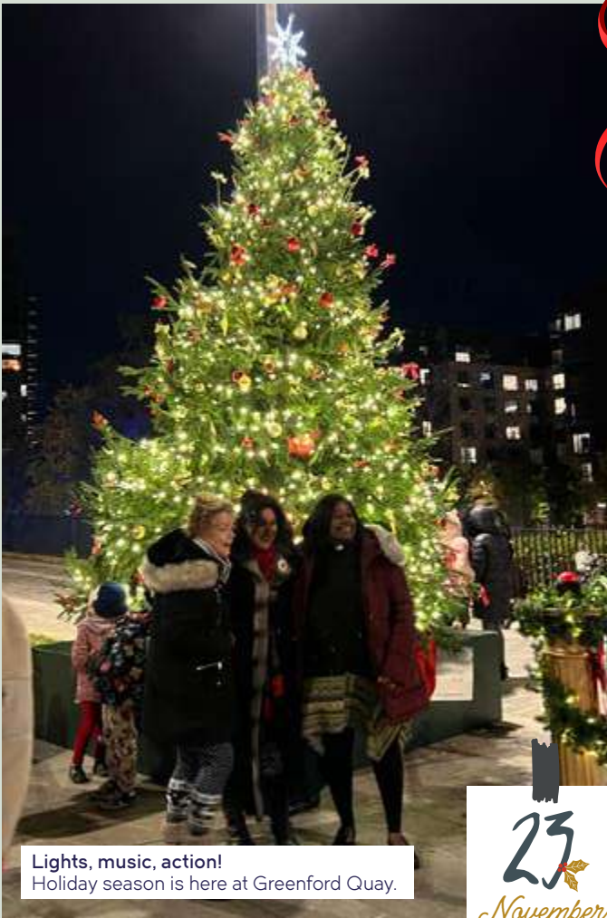
Lights, music, action! Holiday season is here at Greenford Quay.