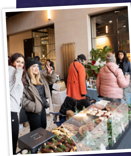
Amazing street food, mulled wine, a real-life Elves Grotto & so much more!

Thank you to all our guests who joined us for a dazzling night to remember at the Winter Forest Festive Dinner, our first Black-tie seasonal soiree at Lyons Dock in support of the Royal British Legion.