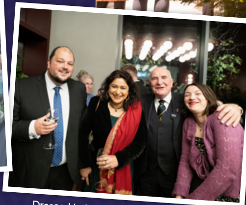
Dressed to impress for a great night out in support of the Royal British Legion.