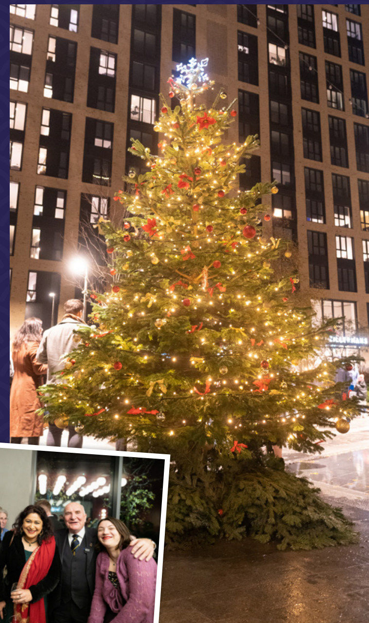
Our Christmas Tree display in Grenan Square!