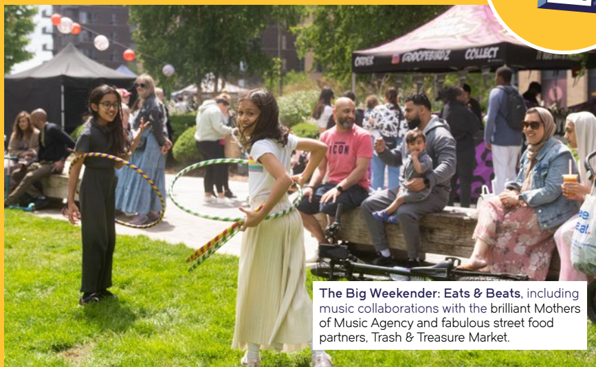
The Big Weekender: Eats & Beats, including music collaborations with the brilliant Mothers of Music Agency and fabulous street food partners, Trash & Treasure Market.

Free and open to all ages, the Summer Series kicked off in June with a two-day Big Weekender launch event, including Eats & Beats (Friday) and Street Food Saturday: Garden Party Edition (Saturday). With 900+ attendees, our residents and locals enjoyed live lounge music sessions, great grub from street food vendors, boat trips, live food demos, all day activities for the kids, and more. Thank you to everyone who joined us to open our third Summer Series at Greenford Quay.