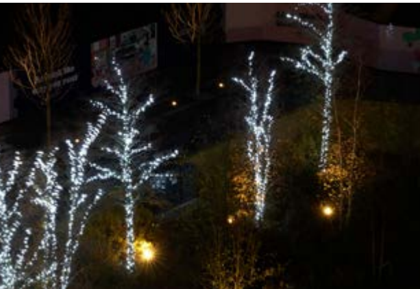
Let there be light: After a year of lockdowns and COVID-19 restrictions, our festive light display is bringing some much-welcome Christmas cheer to Greenford Quay.